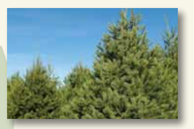
SUSTAINABLE WOOD Our foundation units feature furniture-grade sustainable wood that is untreated and has no chemical additives.

RECYCLED STEEL The steel in our coil unit is made with recycled materials and is 95% recyclable.